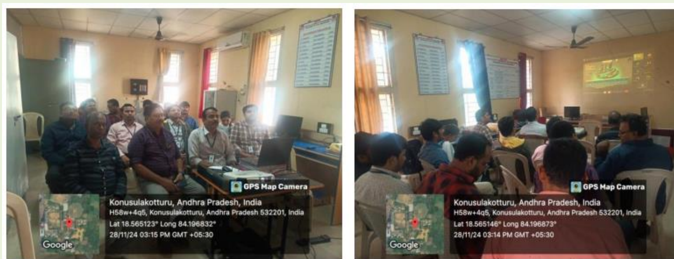
Live Sessions for Faculty on “Managing Infrastructure in Urban Areas” during FDP

The various sessions included in the entire Faculty Development Program are Introduction to Managing Infrastructure in Urban Areas, Planning for Zero Carbon Cities, Planning for Urban Green Spaces, Sustainable Transport in Urban Areas, Environment Impact Assessment for Infrastructure Projects, Role of Artificial Intelligence in managing Urban Infrastructure, Software Interventions for design of Infrastructure, Financing Urban Infrastructure, Governance in Urban areas, Zero Waste Cities, BIM and Digital Twins and their application for Design, Construction and Maintenance of Infrastructure, Role of GIS in Urban Infrastructure, IoT implementation for smart urban infrastructure.