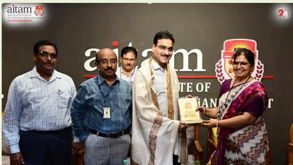
Honouring of Chief Guest and Guest of Honour with AITAM shield on the occasion of Engineers Day Celebrations