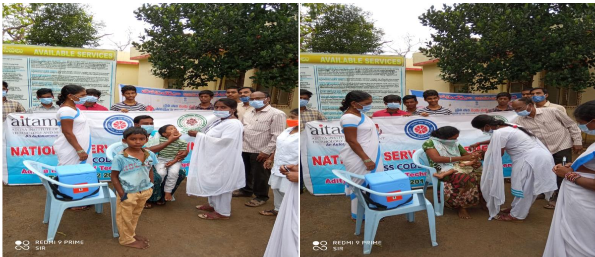
Child health Check-up camp (07/06/2018)