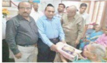
దుస్తులు పంపిణీ చేస్తున్న దృశ్యం