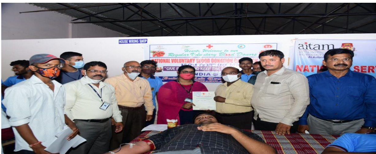
Blood Donation Camp (20/07/2018)