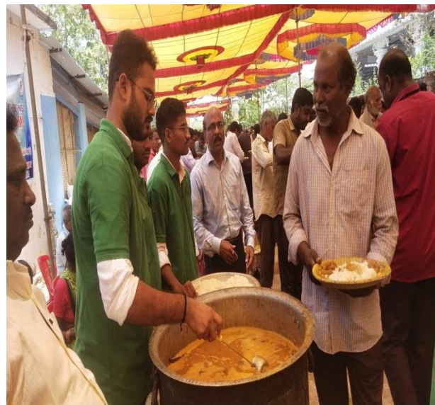
Food donation activity (04/07/2018)