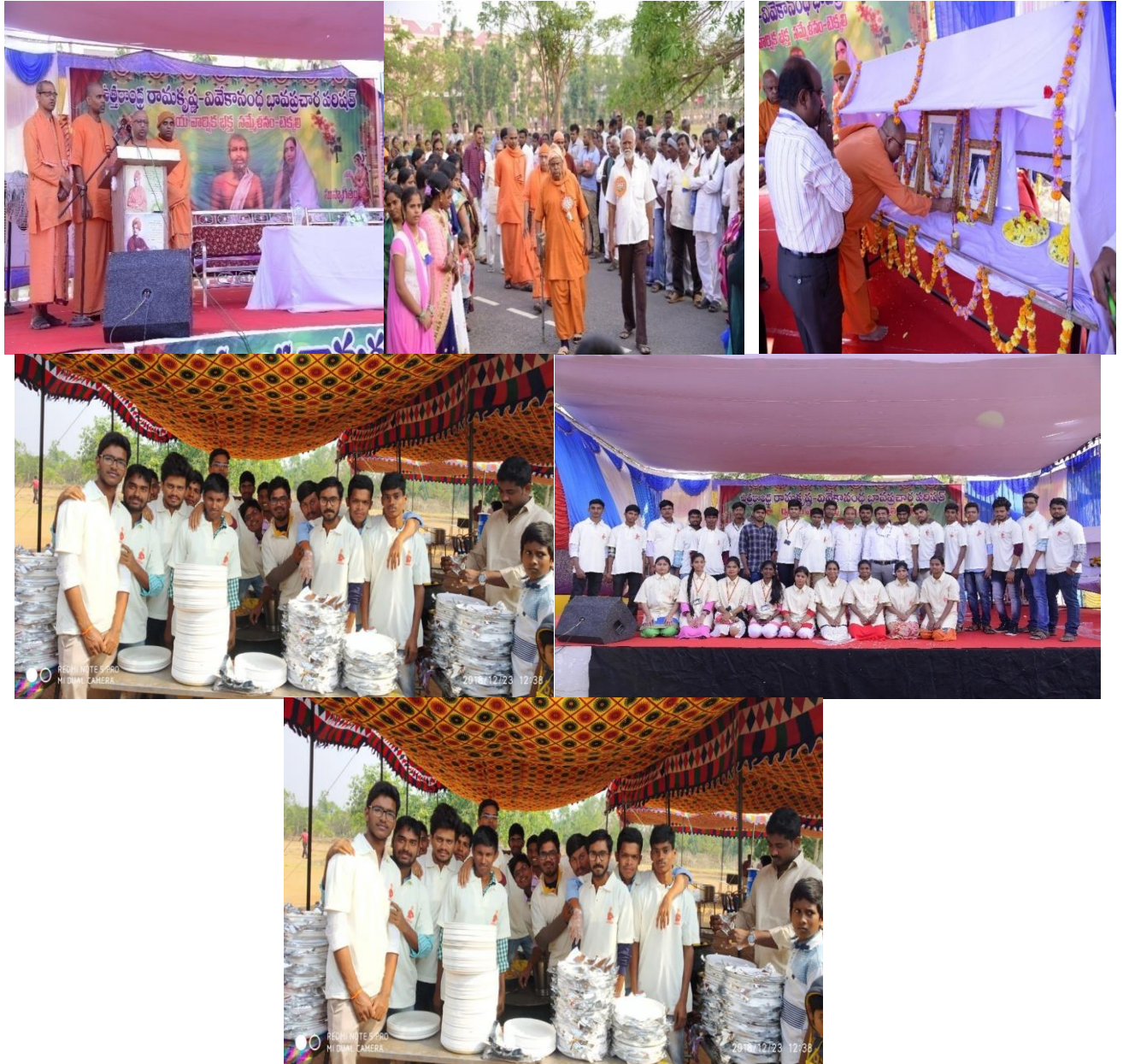
Sri Swami Vivekananda Ramakrishna Bhakta Sammelanam (22/12/2018)