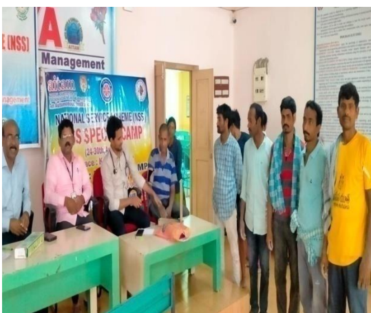
Dengue awareness program (18/06/2018)